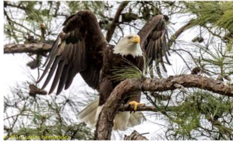
Adult bald eagle soaring near nest