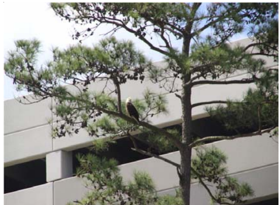
Adult bald eagle in their favorite perch tree next to parking garage