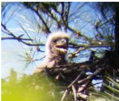
Bald eagle chick about one month old in nest

Interestingly, the bald eagles in The Woodlands continue to nest where they can be easily viewed by the public. Even though a parking garage was built on Lake Front Circle right near their nest tree, they returned again this year to raise their family. Many people in The Woodlands are getting to watch the family.