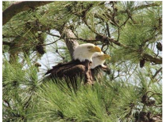
Pair of bald eagles from their favorite perch near the nest

A great place to view this bald eagle nest is from the parking lot of "The Loft" which is located on Lake Front Circle between Lake Woodlands Drive and Grogan's Mill Road. Bring your binoculars, a chair, an umbrella for shade and a camera and enjoy watching the bald eagle family.