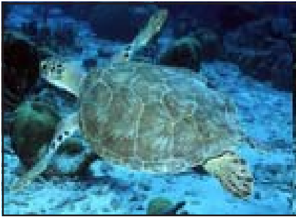
Green Turtle, ( Chelonia mydas )